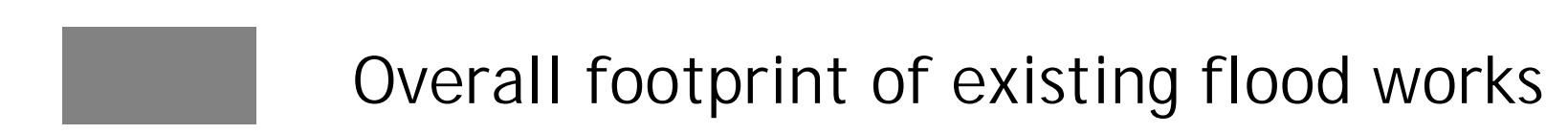
Existing Flood Works Map (FMP025_Version 1)

FLOODPLAIN MANAGEMENT PLAN FOR THE LOWER NAMOI VALLEY FLOODPLAIN 2020