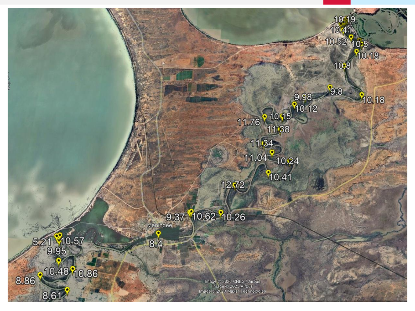
Figure 1: Google Earth image showing dissolved oxygen results (mg/L) from the Lake Pamamaroo outlet to downstream of the Darling River-Menindee Creek junction on 17 July 2023

Frequent longitudinal surveys of dissolved oxygen have been undertaken by WaterNSW down this reach of the Darling River. Figure 2 shows that dissolved oxygen levels have continued to improve since the initial survey undertaken on 25 March. Dissolved oxygen levels increased in May but were still below the critical threshold for fish health of 4 mg/L in the vicinity of Menindee town. Since then, dissolved oxygen levels have remained above 4 mg/L. The most recent survey undertaken on 17 July shows oxygen levels are the highest they have been for some months and are well above the critical level for fish health of 4 mg/L. There was a lot of fluctuation in dissolved oxygen results down the Darling River that has not been present in previous surveys. At this stage it is not clear what is causing these fluctuations.