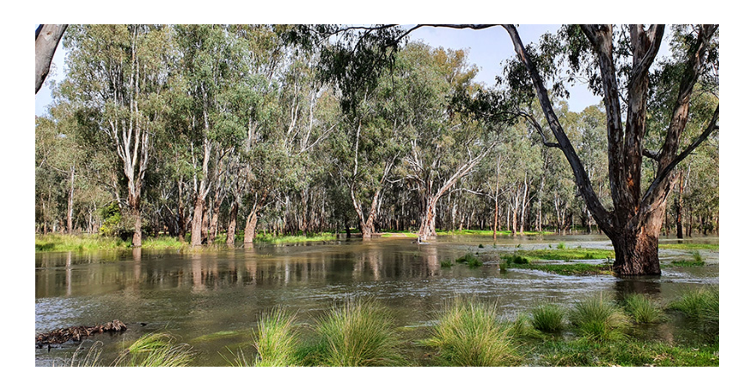
Wetlands on the Murray River near Howlong

Read more about Menindee fish deaths (https://water.dpie.nsw.gov.au/menindee)