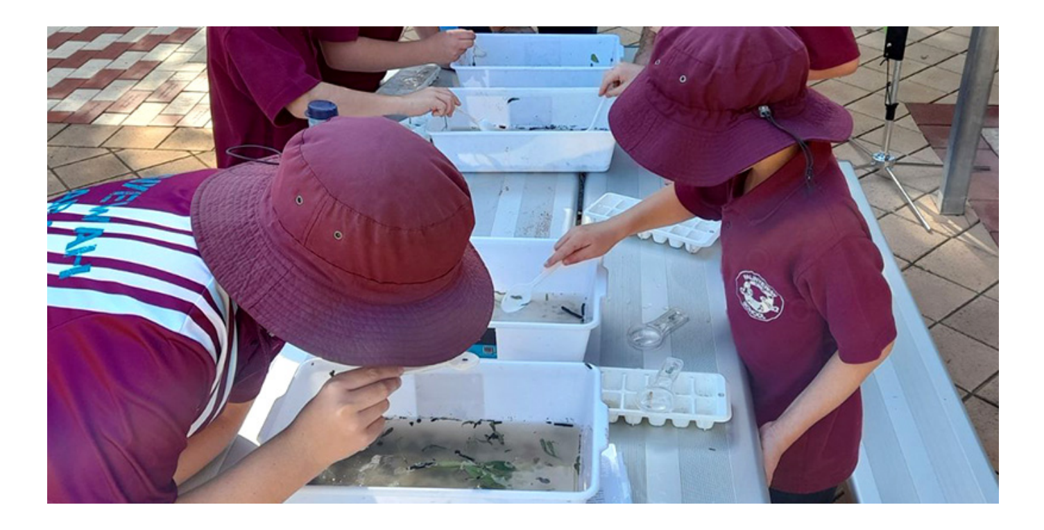
Children at remote schools benefit from funding boost