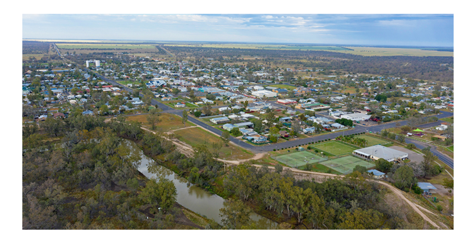
Aerial view of Walgett