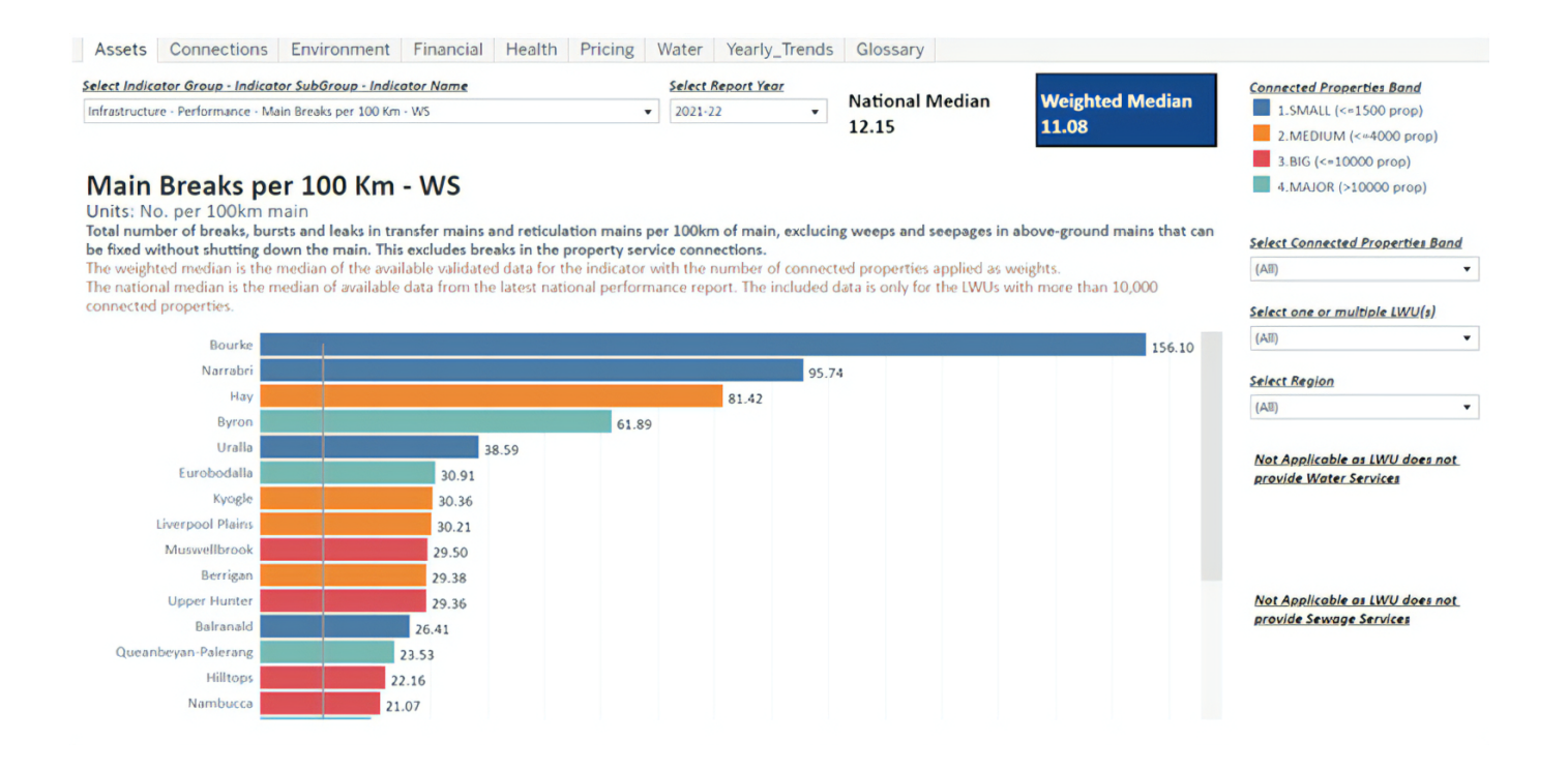
2021-22 LWU performance monitoring data now available