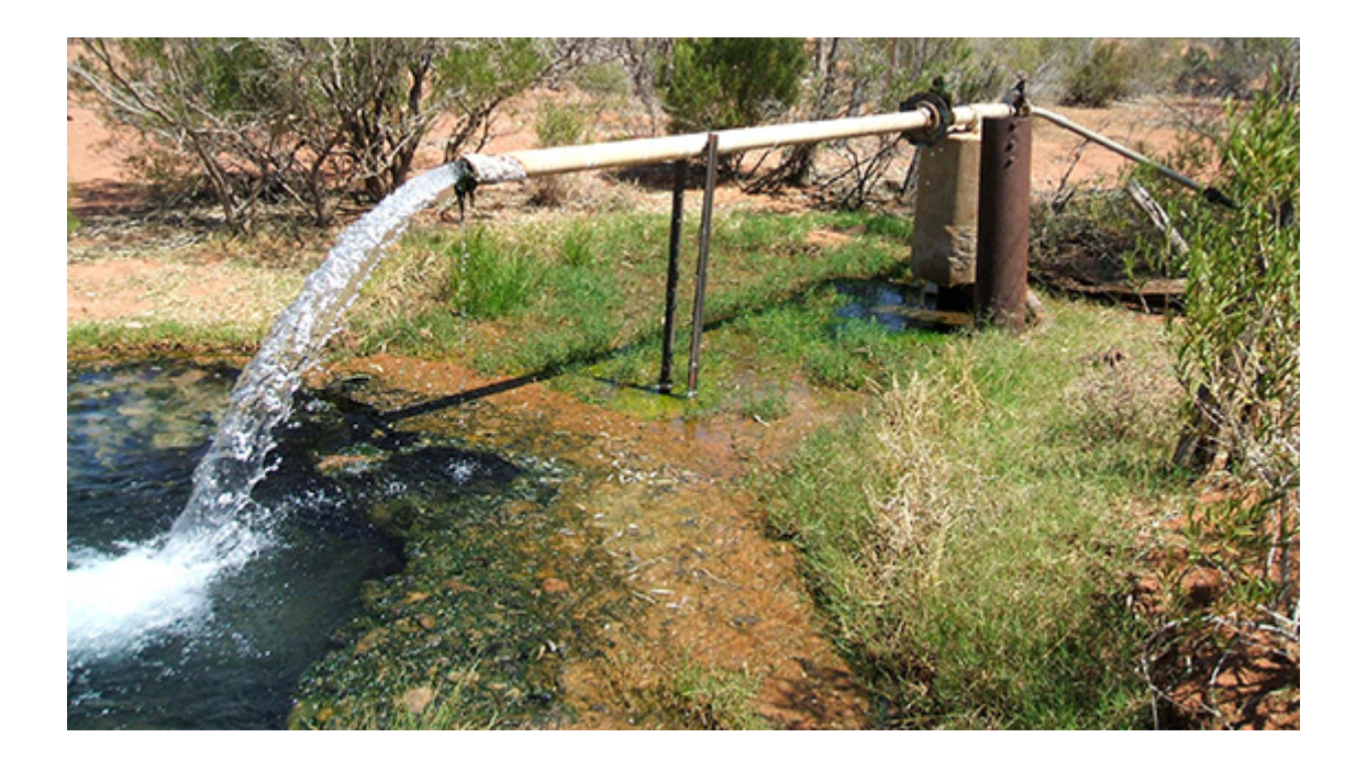
Are you in the Great Artesian Basin? Do you want to know your bore water pressure and flow? Would you like to make sure your bore is considered for future funding?

If you've answered yes to any of these questions, we'd like to hear from you. The department is calling on landholders in the Great Artesian Basin (GAB) with a water supply bore to register for the GAB Bore Survey Project. We've surveyed 800 bores already, and provided a water quality and bore condition report to each landholder.