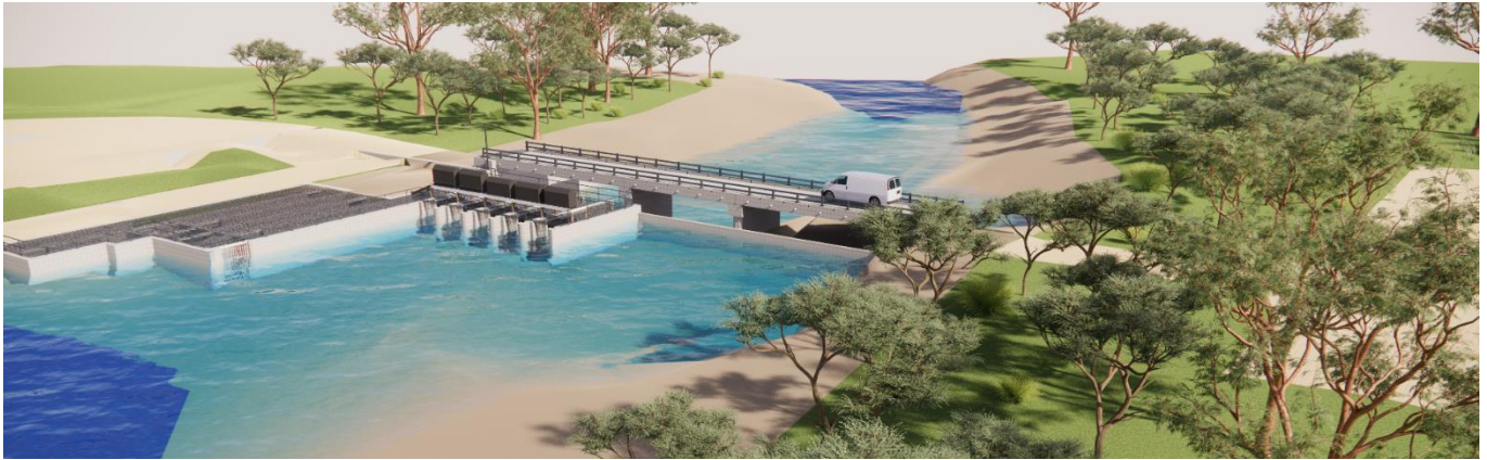
Figure 4: Indicative layout of a regulator

An indicative layout of a regulator is shown in Figure 4. This example is of a five gate regulator with a fish passage (on the left) and trafficable deck for maintenance vehicles.