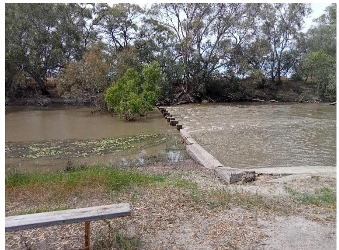
Figure 3: Wanganella Weir

In summary, the proposal would contribute to the Yanco Creek Modernisation Project through a focus on delivering improved environment outcomes through upgraded infrastructure and smarter use of water.