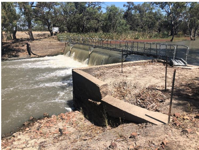
Figure 2: Hartwood Weir

The weirs included in the proposal are shown in Figure 2 and Figure 3.