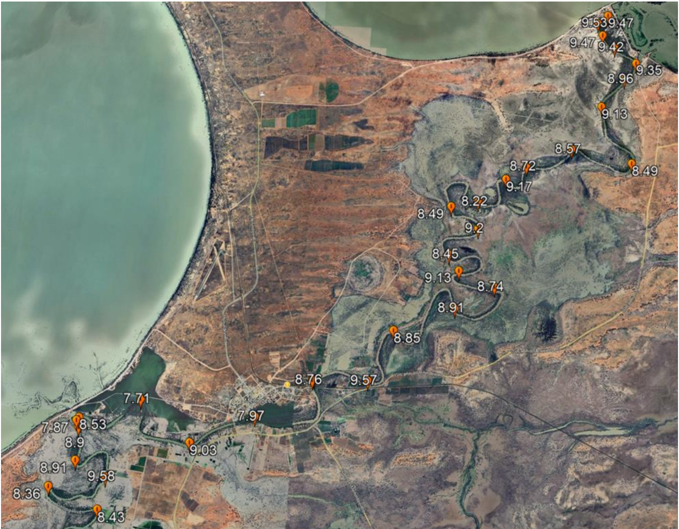
Figure 1: Google Earth image showing dissolved oxygen results (mg/L) from the Lake Pamamaroo outlet to downstream of the Darling River-Menindee Creek junction on 17 August 2023

general guide, native fish and other large aquatic organisms require at least 2 mg/L of dissolved oxygen to survive but may begin to suffer if levels are below 4 to 5 mg/L for prolonged periods.