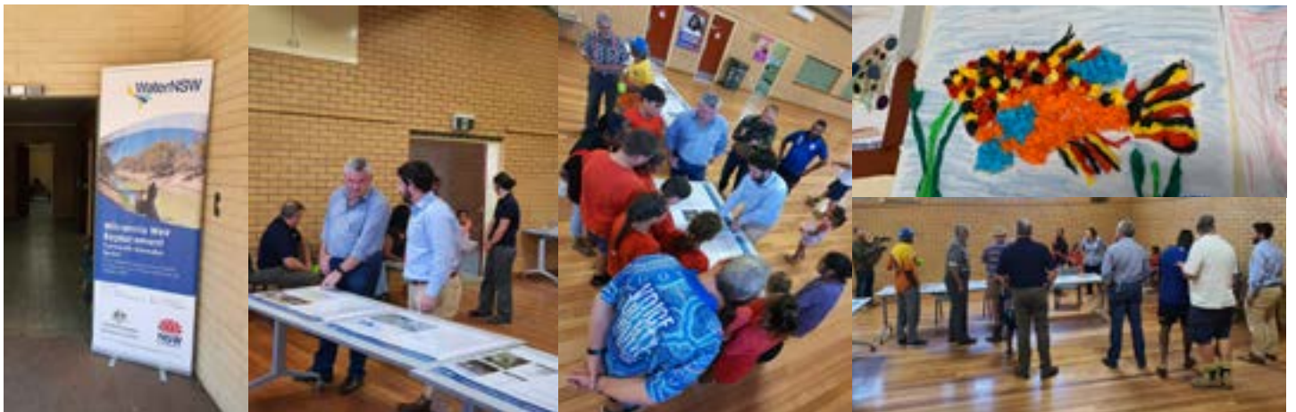
Community members and school kids with WaterNSW CEO and project team at the Weir community information session in the hall.

A big thank you to the community for giving us their time and feedback over these two days.