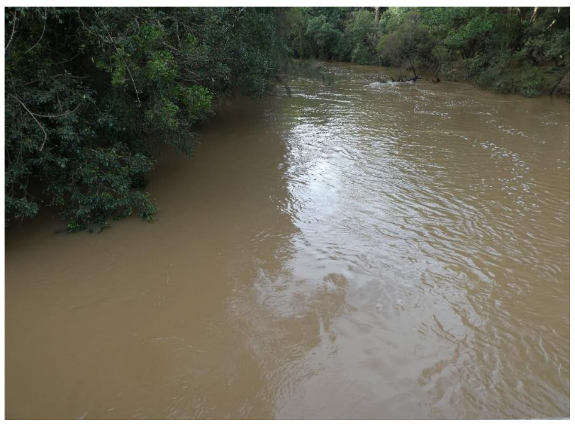
This is what the Orara River looks like every time there is any rain heavier than a drizzle

The Coffs Harbour District Water Sharing Plan has attracted our attention because it is supposed to address the extreme pressures on water supplies from an unregulated intensive horticultural industry. Of course, that industry isn't restricted to the coastal rivers of the Coffs Coast, but is now rampant in the Orara Valley hinterland, and spilling across the Dirty Creek range into the Clarence Valley. It is what is happening there that is having serious impacts on river flows and water quality in the Clarence River catchment.