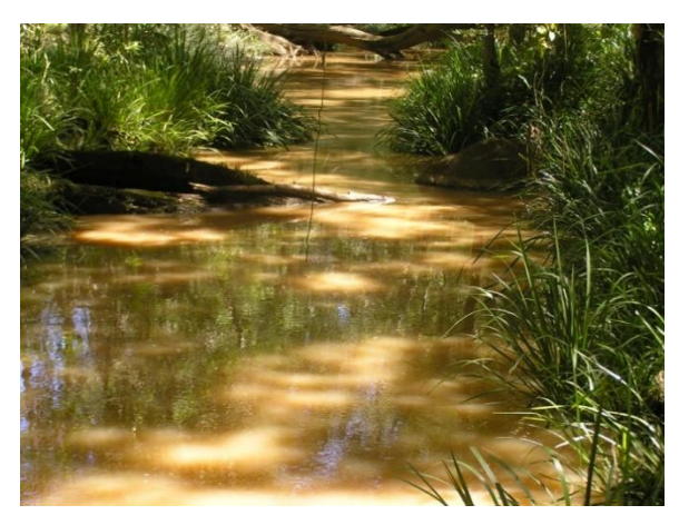
Cleared forest at Halfway creek, where massive erosion polluted Dundoo Creek, and the Orara River