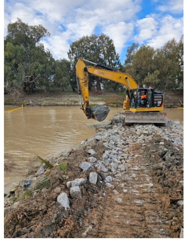
Figure 2: Excavator creating platform to support weir removal.