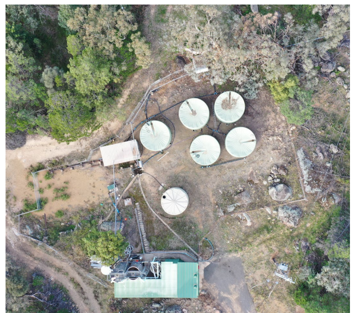
Existing Wyangala Water Treatment Plant

Areas disturbed by the construction of the new Wyangala water treatment plant will be rehabilitated as appropriate before the plant is completed.