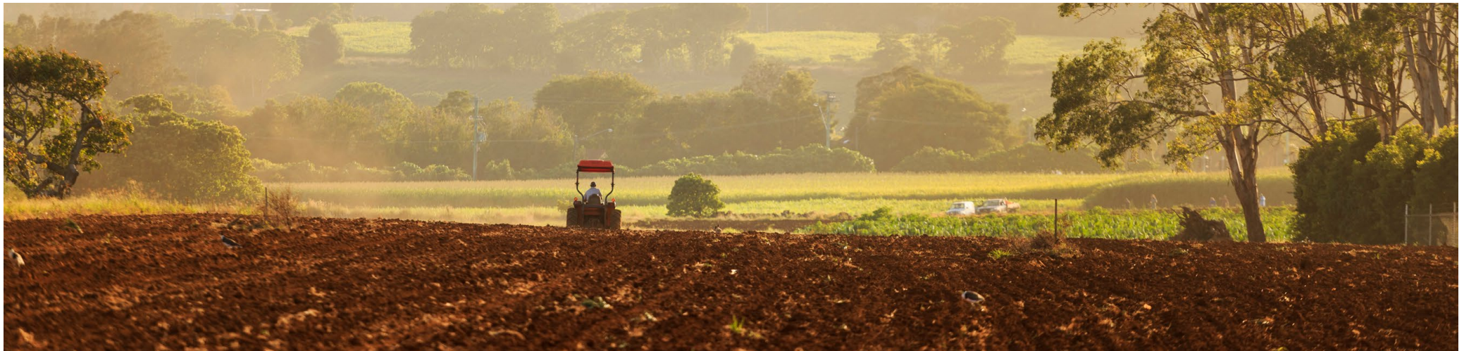
Cudgen Farmland, NSW.