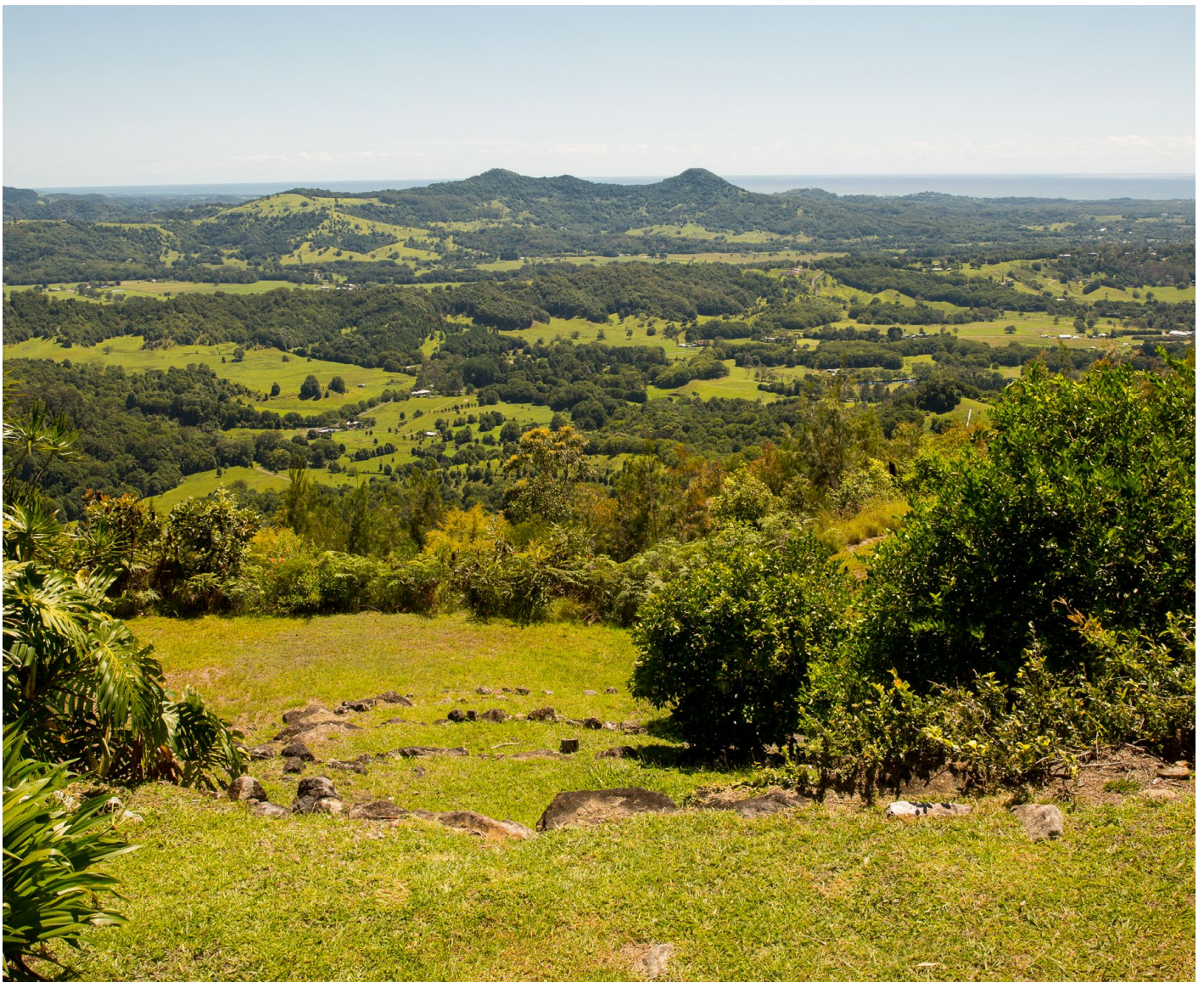
Koonyum Retreat, Mullumbimby.

Agencies or partners that play a supporting role in delivering the program are listed as 'Supported by' under each sub-action.