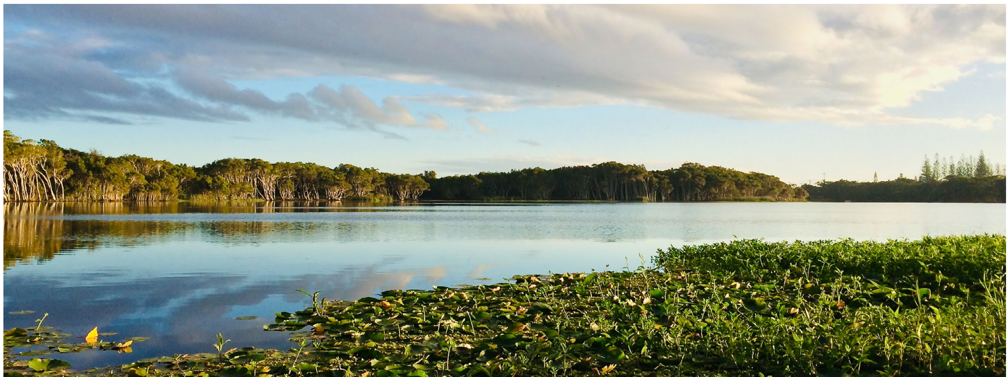
Lake Ainsworth, Lennox Head.