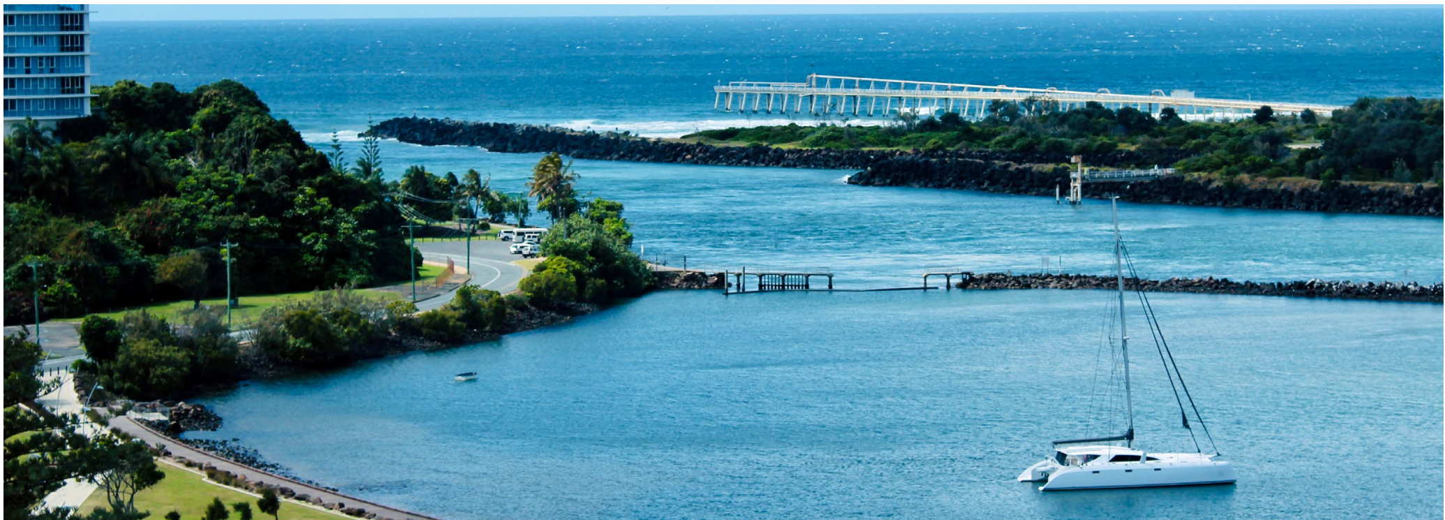
Tweed Heads, NSW.