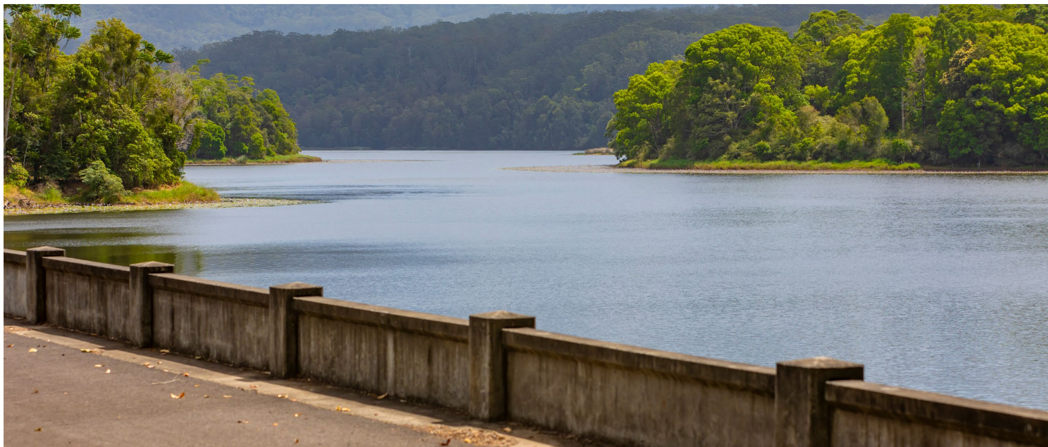
Rocky Creek Dam, Lismore.