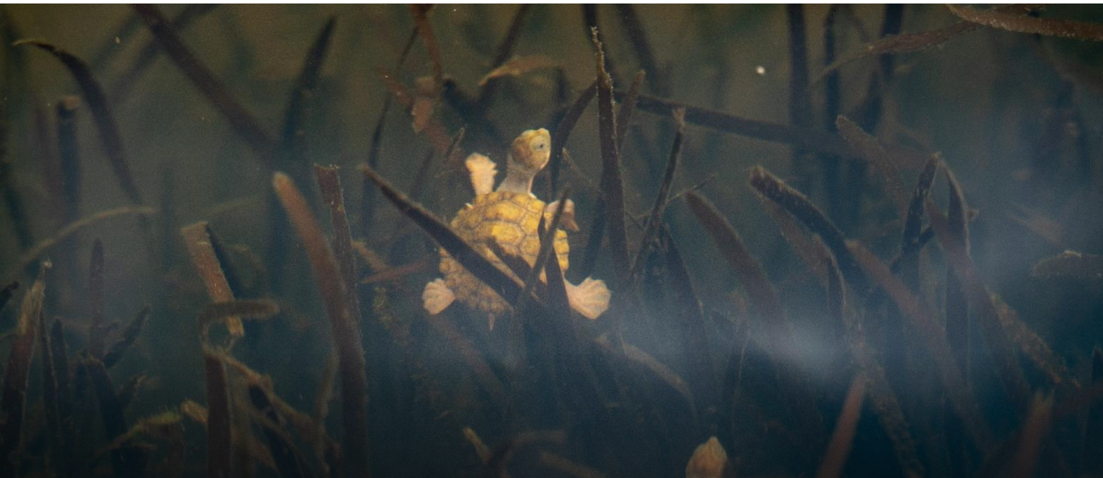
Bell's turtle ( Myuchelys bellii ) hatchlings in shallow fringing aquatic vegetation

Cease to flows, and pool drawdown can reduce the amount of habitat available to hatchlings, forcing them into deeper water without the vegetative cover necessary to protect them from predation. This means that reducing the length of cease-to-flow events, and ensuring full pool capacity (i.e. 100% at the start of a cease-to-flow period) with a natural rate of pool drawdown is critical for protecting the aquatic refuge habitats for the Bell's turtle, particularly in their early life stages.