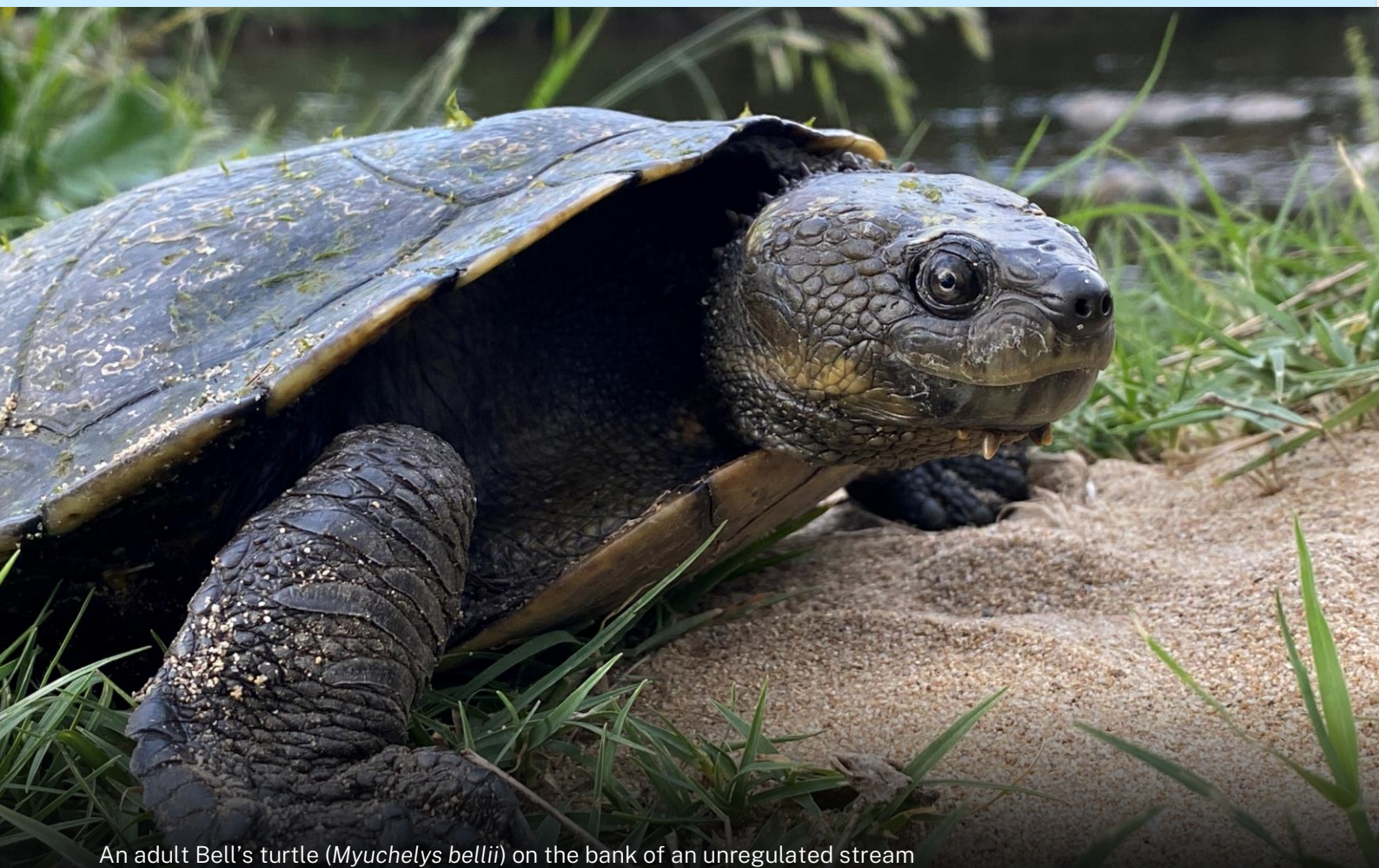
An adult Bell's turtle ( Myuchelys bellii ) on the bank of an unregulated stream