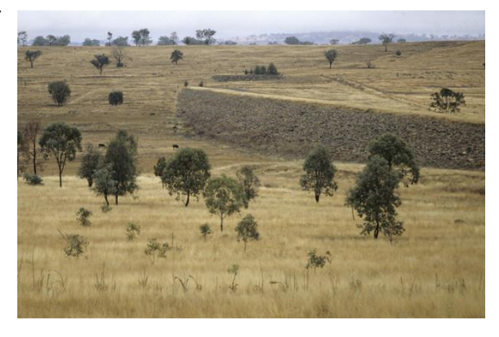
Figure 1. Keepit Dam pictured during the 1995 drought

For water quality events, management responses will be guided by the type of event, which can be varied.