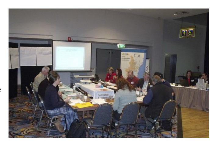
Figure 2. Critical water advisory panels are formed when necessary

The Department seeks input from a range of different agencies, with a focus on incorporating local knowledge to inform recommendations to the Minister.