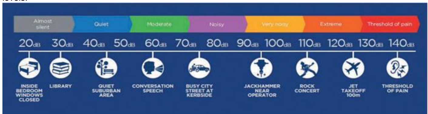
Noise level comparisons sourced from Transport for NSW's Construction Noise and Vibration Strategy

Rock breaking will be the noisiest activity during the site preparation work. Rock breaking will create noise levels up to 65 dB generally for surrounding community. This is more than conversation speech but less than a busy street. Other activities will create less noise. We have provided a diagram to help explain noise levels.