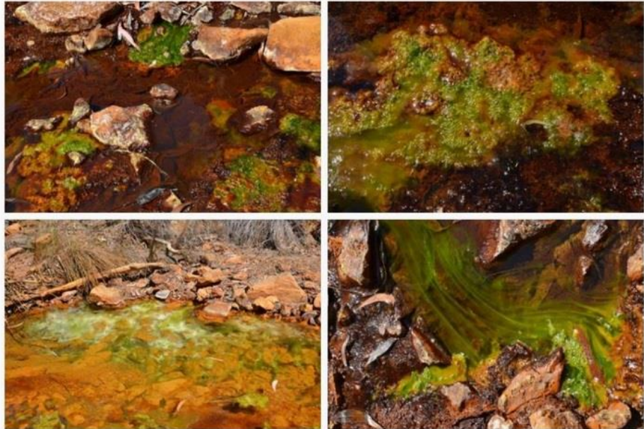
Red iron sludge, green algae and white deposits in Jamie Creek.

heritage sites, and places of environmental significance, and scenic beauty, where mining simply should not occur, and declare them off-limits.