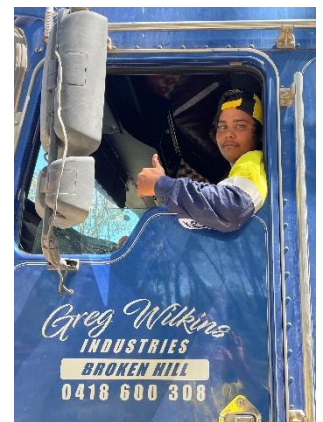
Images: Community members involved in the Union Bend roadwork